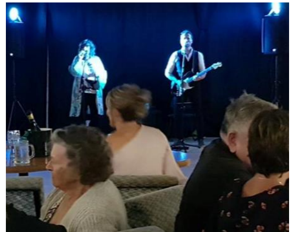
The Love Jones entertained Friday night

Merv "The Swerve" spins the raffles from around 4.30 onwards, Happy hour 5 - 6pm, Joker 500 on sale from 5pm, Club Membership Draw drawn between 5.30 - 6.30pm.